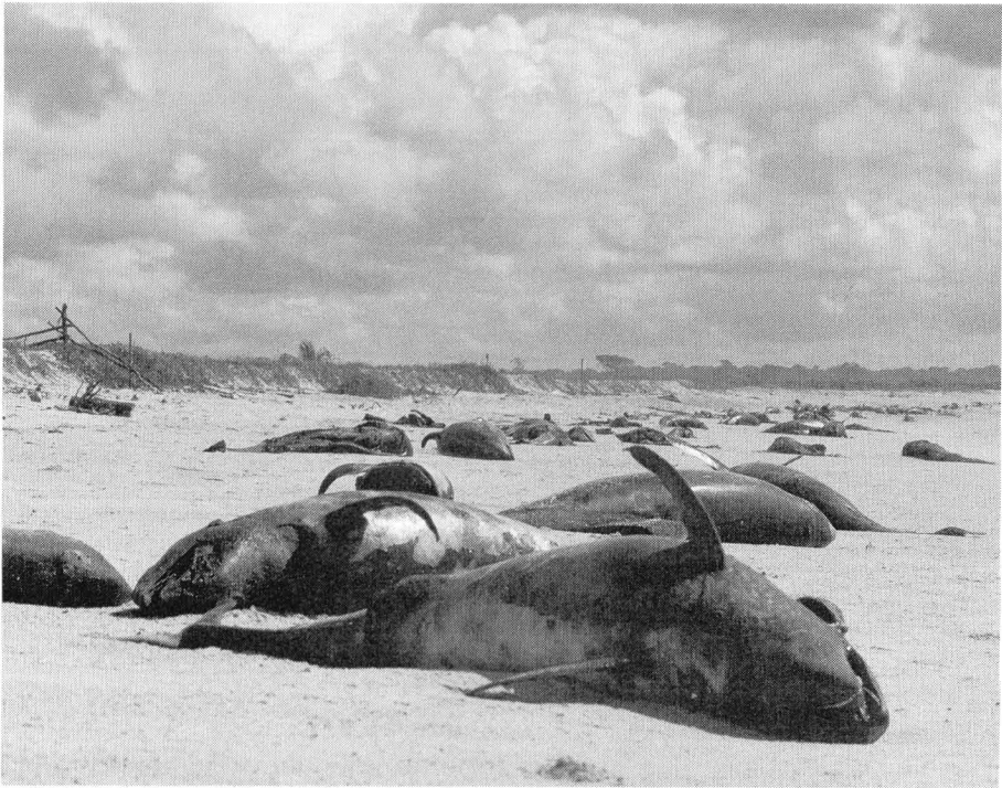
Fig. 1. Stranded melon-headed whales on Piracanga Beach, April 1987.