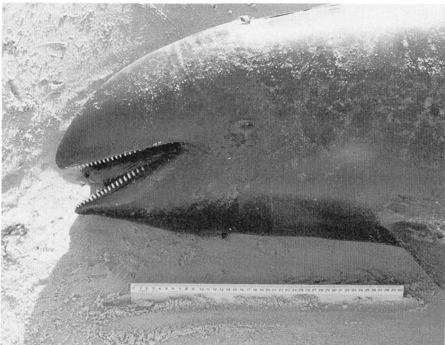
Fig. 2. Head of a melon-headed whale showing its coloration a few days after death.